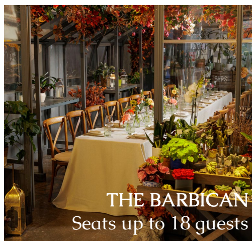
THE BARBICAN Seats up to 18 guests