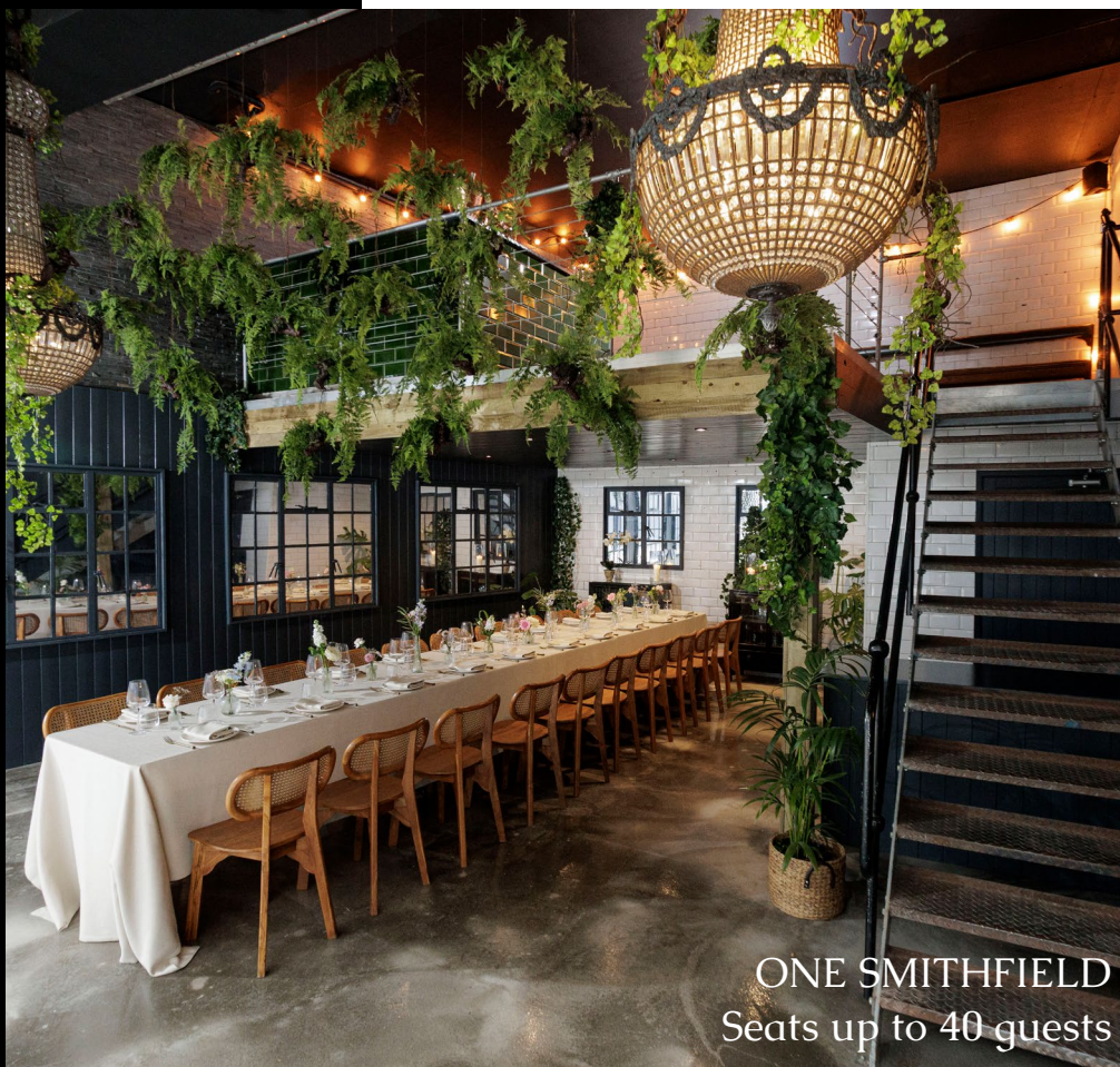
ONE SMITHFIELD Seats up to 40 guests