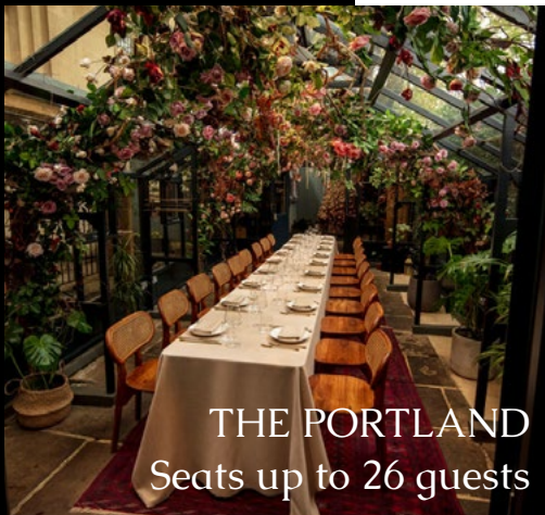
THE PORTLAND Seats up to 26 guests