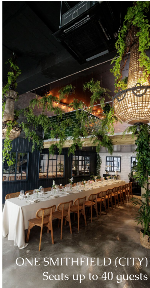
ONE SMITHFIELD (CITY) Seats up to 40 guests