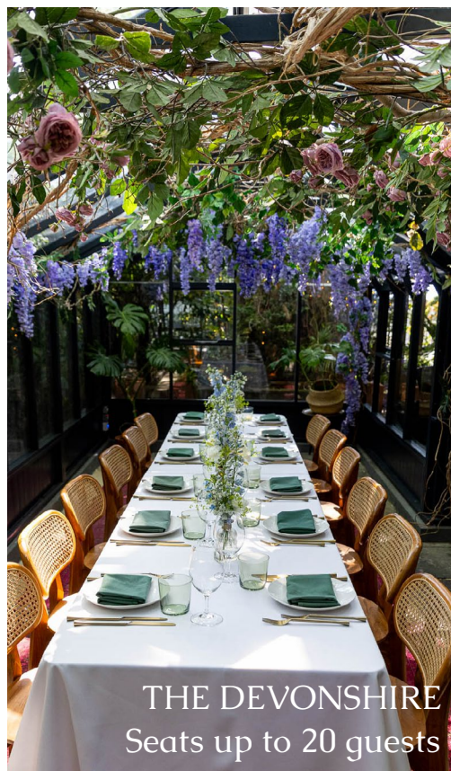
THE DEVONSHIRE Seats up to 20 guests