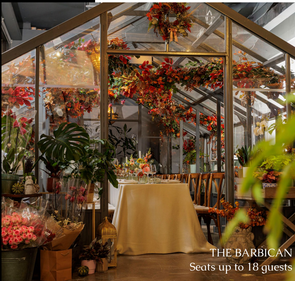
THE BARBICAN Seats up to 18 guests