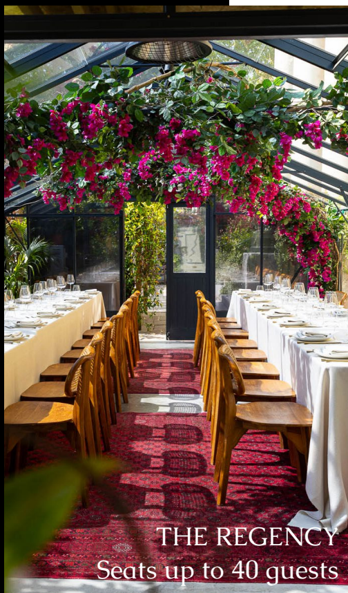
THE REGENCY Seats up to 40 guests