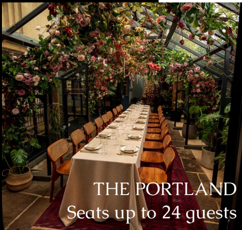
THE PORTLAND Seats up to 24 guests