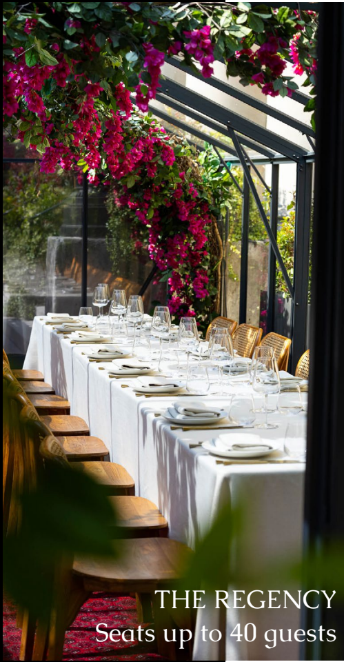
THE REGENCY Seats up to 40 guests