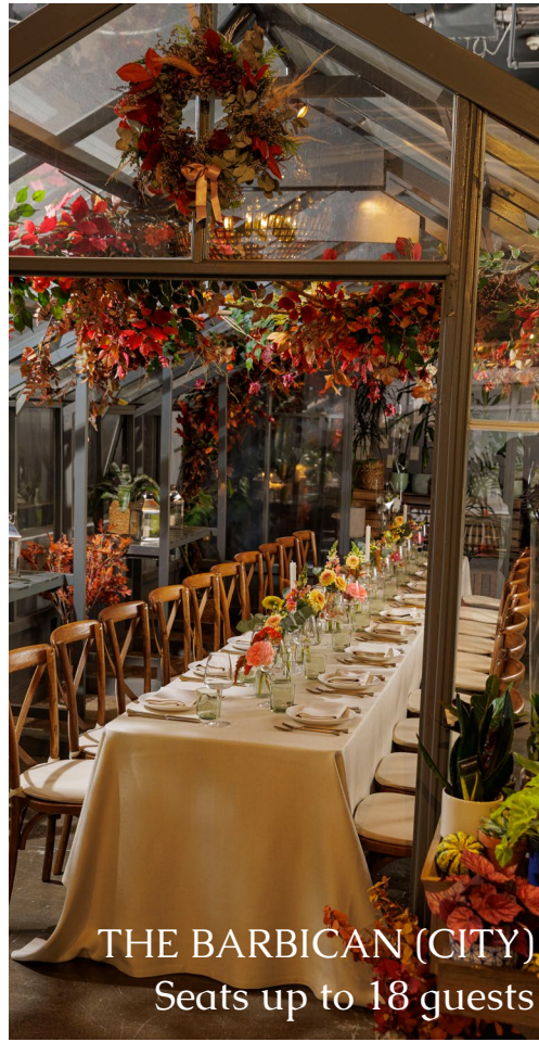
THE BARBICAN (CITY) Seats up to 18 guests